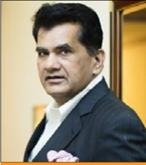
AMITABH KANT G20 India Sherpa

Amitabh Kant is India's G20 Sherpa, and the former Chief Executive Officer of the National Institution for Transforming India (NITI Aayog) (2016-2022), as well as the former Secretary of the Department for Industrial Policy and Promotion (DIPP) (2014-2016), Government of India (GoI). He is a member of the Indian Administrative Service, IAS (Kerala Cadre: 1980 Batch).